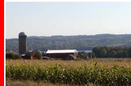
Maxwell Farms with a view of Conesus Lake